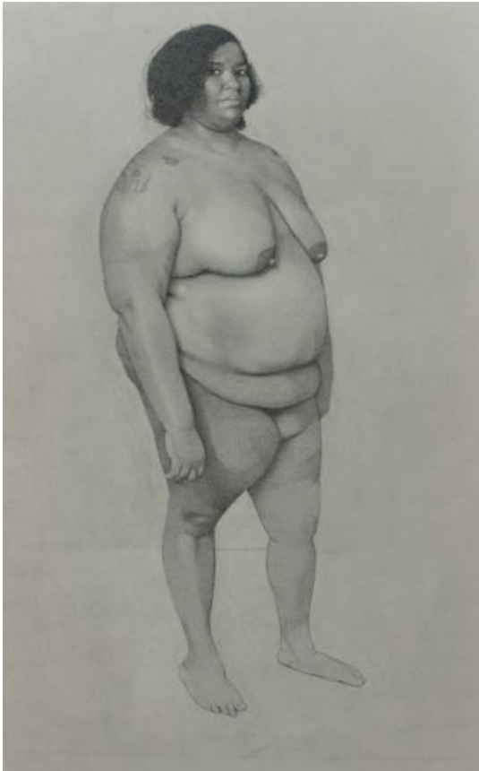
"Arayna." 20" x 12", graphite on paper, 2014

Clift investigates the broad spectrum of female identity today. She strives for an honest, inclusive definition of the concept in the series, "Real Woman," which embraces diversity of age, race, socio-economic background, sexuality, body type. She's concerned with the effect of the modern world and present cultural environment on the human condition, especially as reflected in the female psyche. Her artistic practice is rooted in observational drawing and painting, each work produced from photographs and sketches made during a single, 2 to 3 hour modeling session.