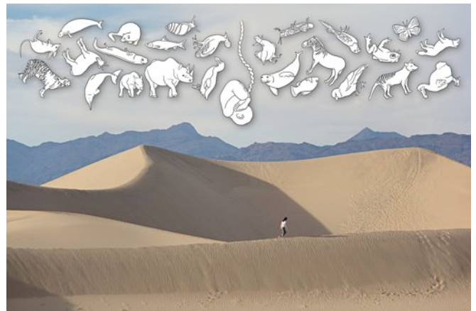
"Where Has the Dodo Gone?" 24" x 36", archival pigment inkjet, 2015

Yoon Cho's drawings are created with a digital pen on a digital tablet. She superimposes her drawings over the photographs of herself walking in different scenes to construct a story in this "Desert Walk" series. The final output of the work is a series of photographic prints, which encapsulate aspects of beauty, destruction, and preservation of the land we live in and celebrate feminine life.