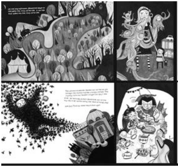
Detail from "Roadkill Collective" 5"x7" pencil & ink, 2012

Cosgrove's "Heroically Ever After," the title of a series of hand-drawn and painted illustrations in both full color and black and white, recreates many powerful female characters and scenes from books that shaped her as a woman and artist. As an illustrator she seeks to create girl-empowering, book-encouraging art. Specifically, the art is based on texts from the following books featuring female protagonists, penned by women authors: Anne of Green Gables, Little Women, The Secret Garden, A Little Princess, Jane Eyre.