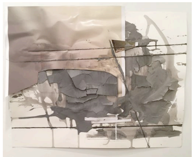
"Untitled 2." 19" x 24", concrete, graphite, hand-cut photographs on paper, 2015

Masley's newest series is large-scale, concrete drawings incorporating collaged photographs. These works address how we recombine the basics of architectural building forms (within the Brutalist style) with two materials from the opposite of the building process. Using cement to sketch and create an organic topography, she then places pieces of photographs within. These photographs are of a model she built from concrete textile samples and hand cut to recreate forms that represent a floor-plan type of image, thus producing imagined, experimental structures and how they might function in current, geopolitical topographies.